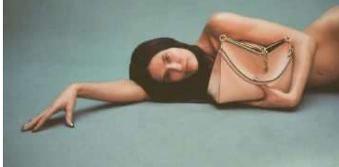
ETRO introduces the Vela bag