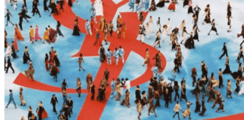
ICONICS: YSL AT THE 1998 WORLD CUP FINAL DURING FFW