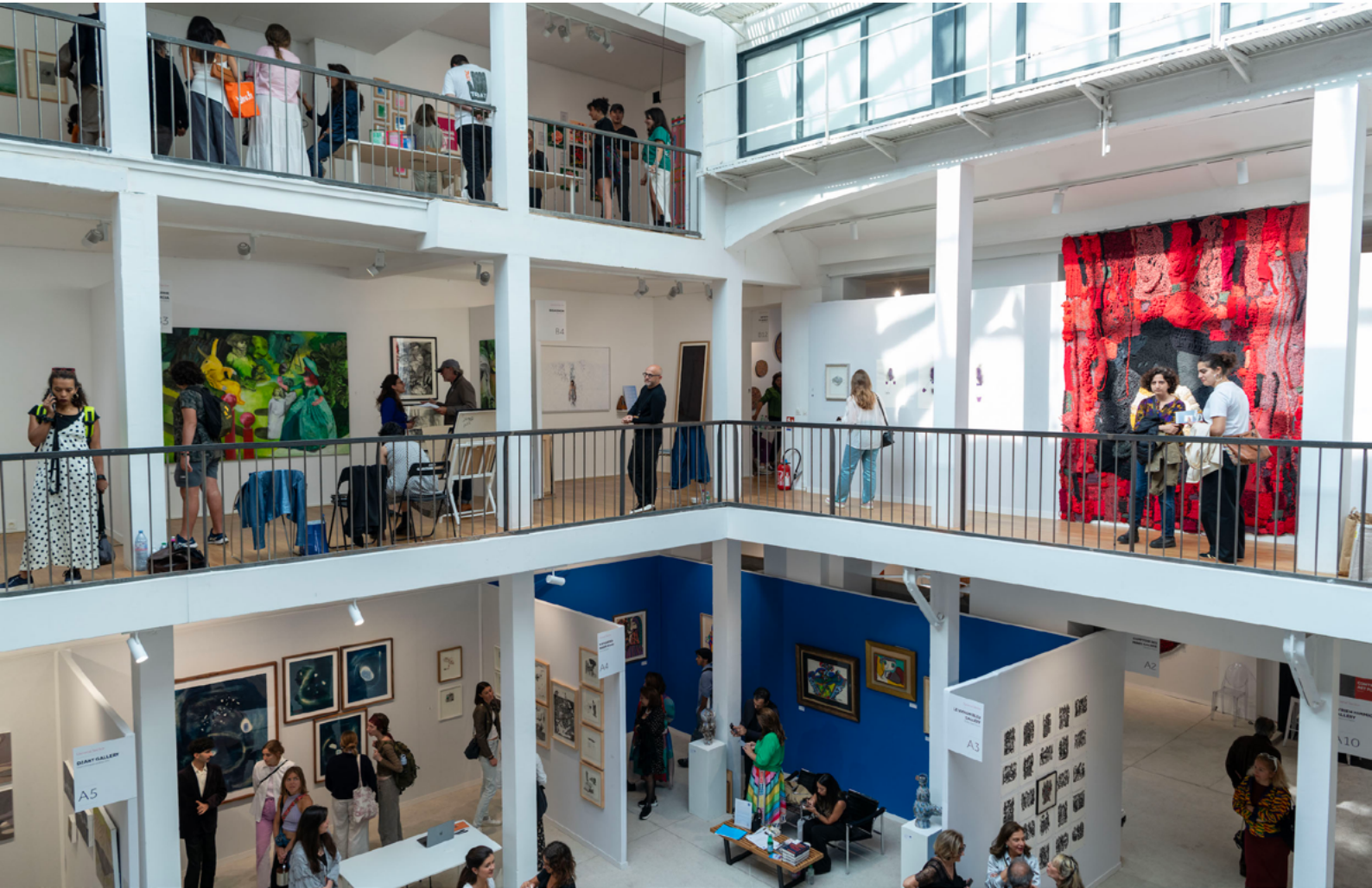
Menart Fair 2024