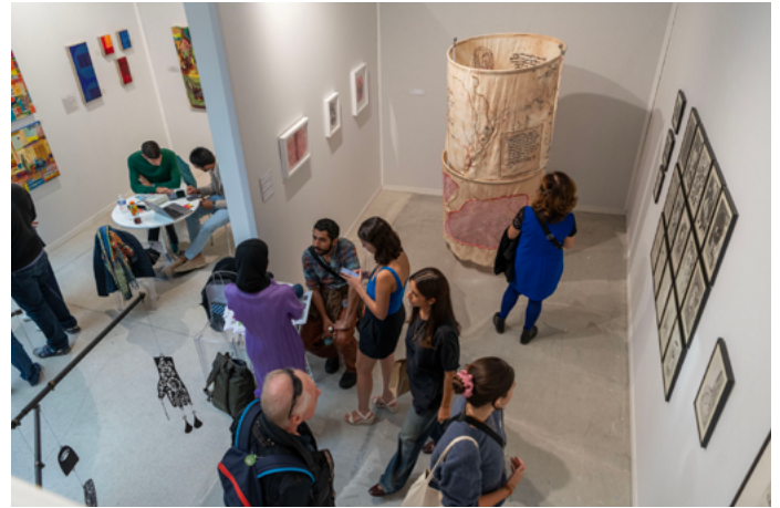
Wusum Gallery