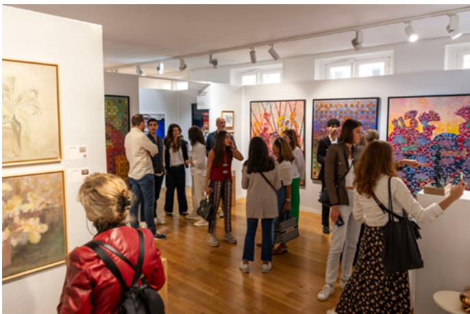
Simine Paris

An event not to be missed in the capital of art, where cultures and ideas converge to shape the art of tomorrow.