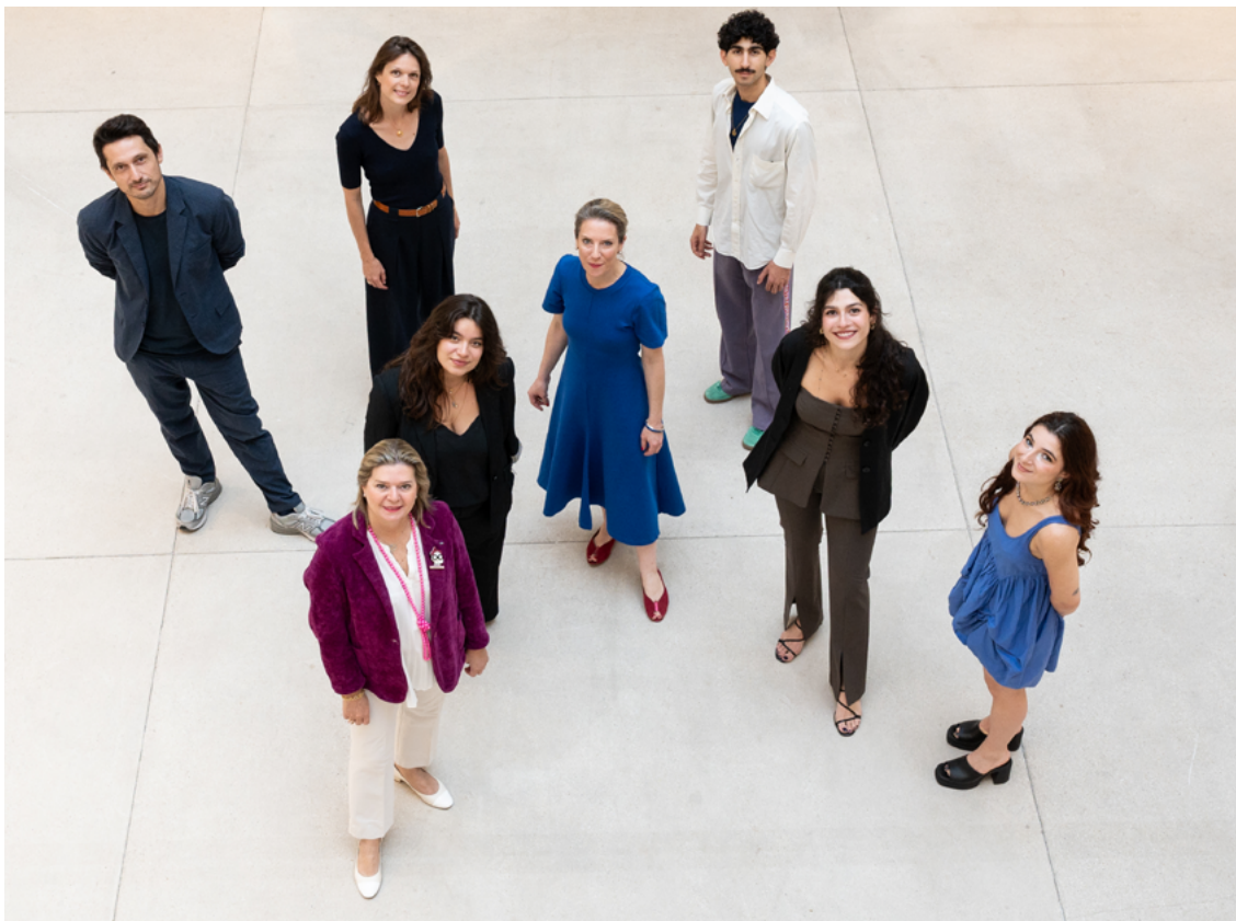
Menart Fair team

See you soon for more exciting discoveries!