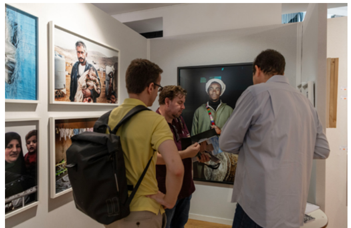
Centre Interculturel Leila Alaoui