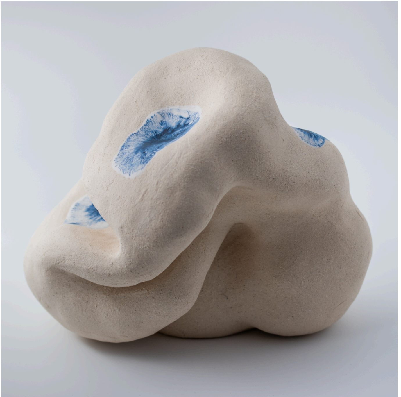
Zineb Mezzour, Shape 4, from the series The Shape of Water, 2023, sculpture in chamotte and porcelaine, Courtesy Myriem Himmich Gallery, Casablanca