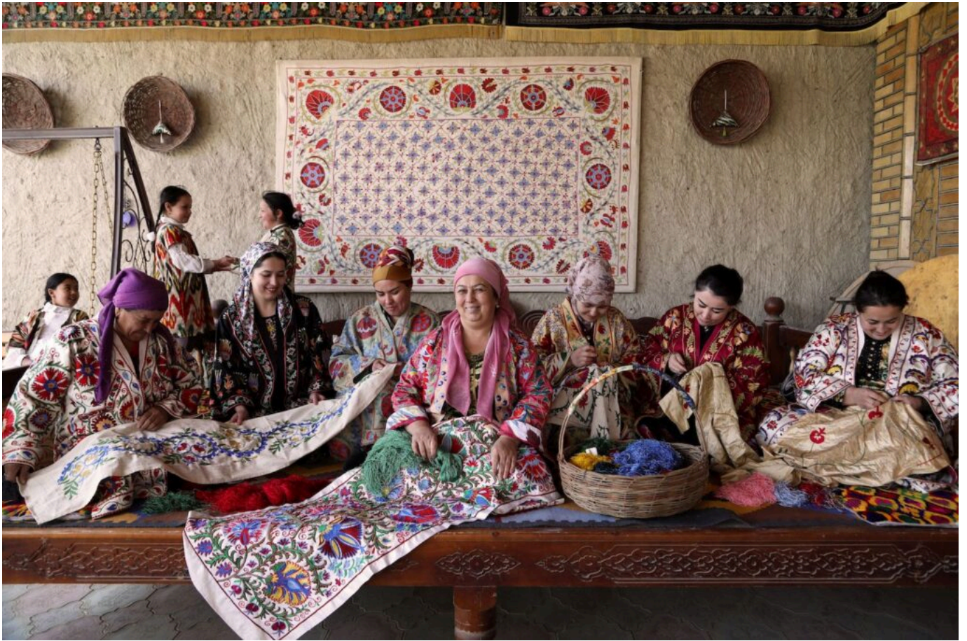
Fatimah Hossaini, Unveiling the Hands of Heritage, 2024, photography, 180x120cm, Courtesy of Art Girls Galerie, Paris