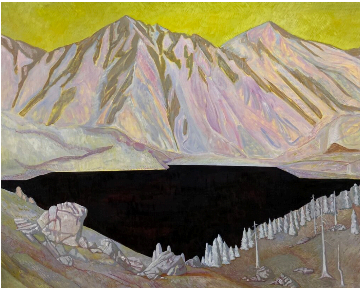
Evgenia Baigaliyeva, Memory, 2023, oil on canvas, 160x200 cm, Courtesy D2 Art Gallery, Dubai