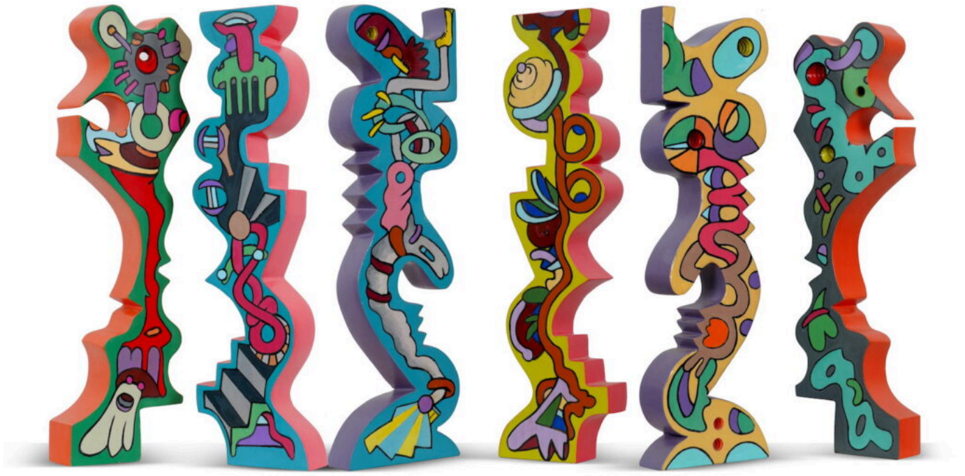
Yasmeen Sudairy & Rajaa AlHajj, Imaginary Poles, 2022, painted wood carvings (six double-sided Poles), 30x5cm, Courtesy Gallery Bawa, Kuwait