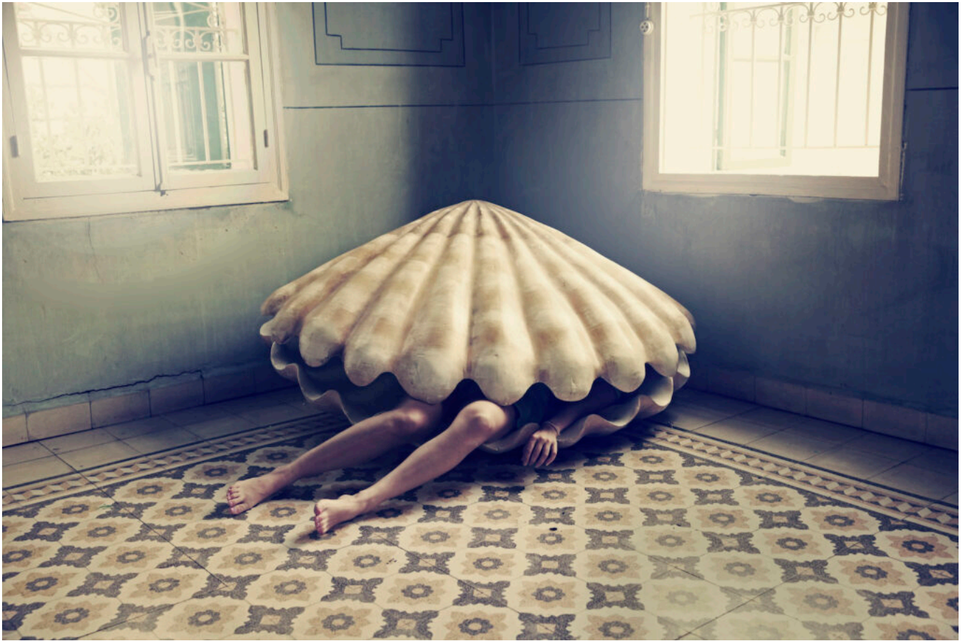
Lara Zankoul, The Magic Clam , 2020, photography, 90x60cm, Courtesy of Art Girls Galerie, Paris